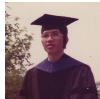
1973 UR Graduation