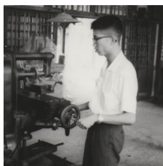
1965 NTU Machine Shop